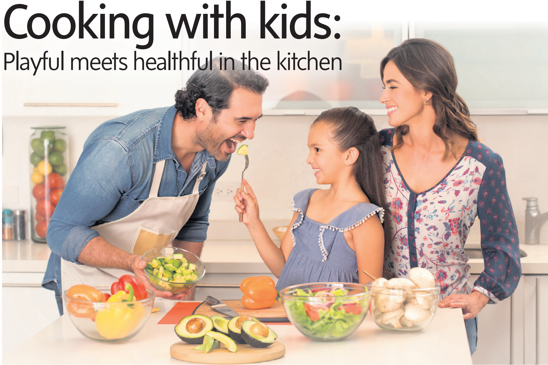
The kitchen is a playground for learning. Involve your kids in cooking now — and their bodies will thank them for life!